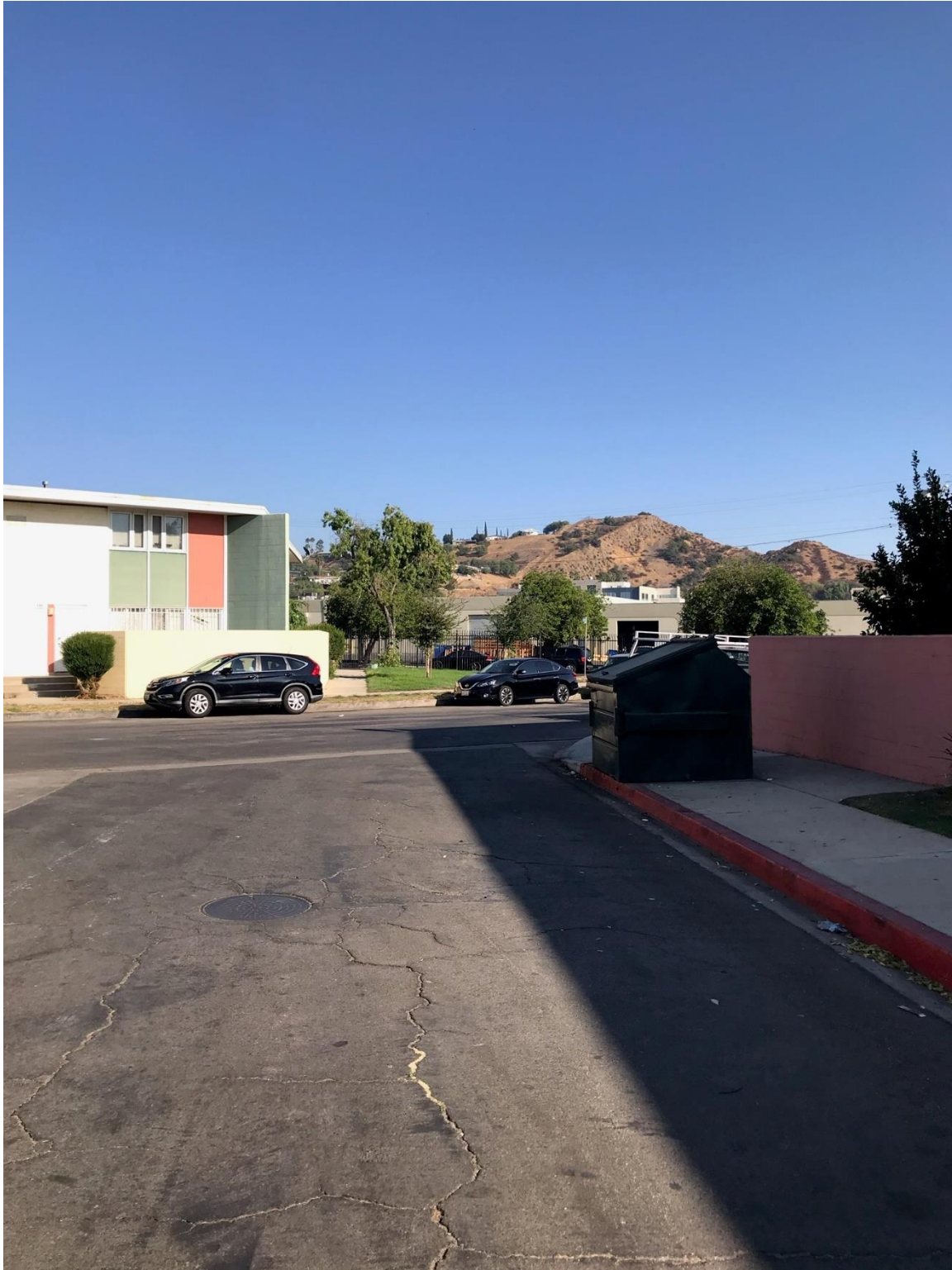
A clearly posted stop sign at this intersection of Carl Place/Lehigh Ave. Photo depicts facing eastbound on Carl Place approaching Lehigh Ave.