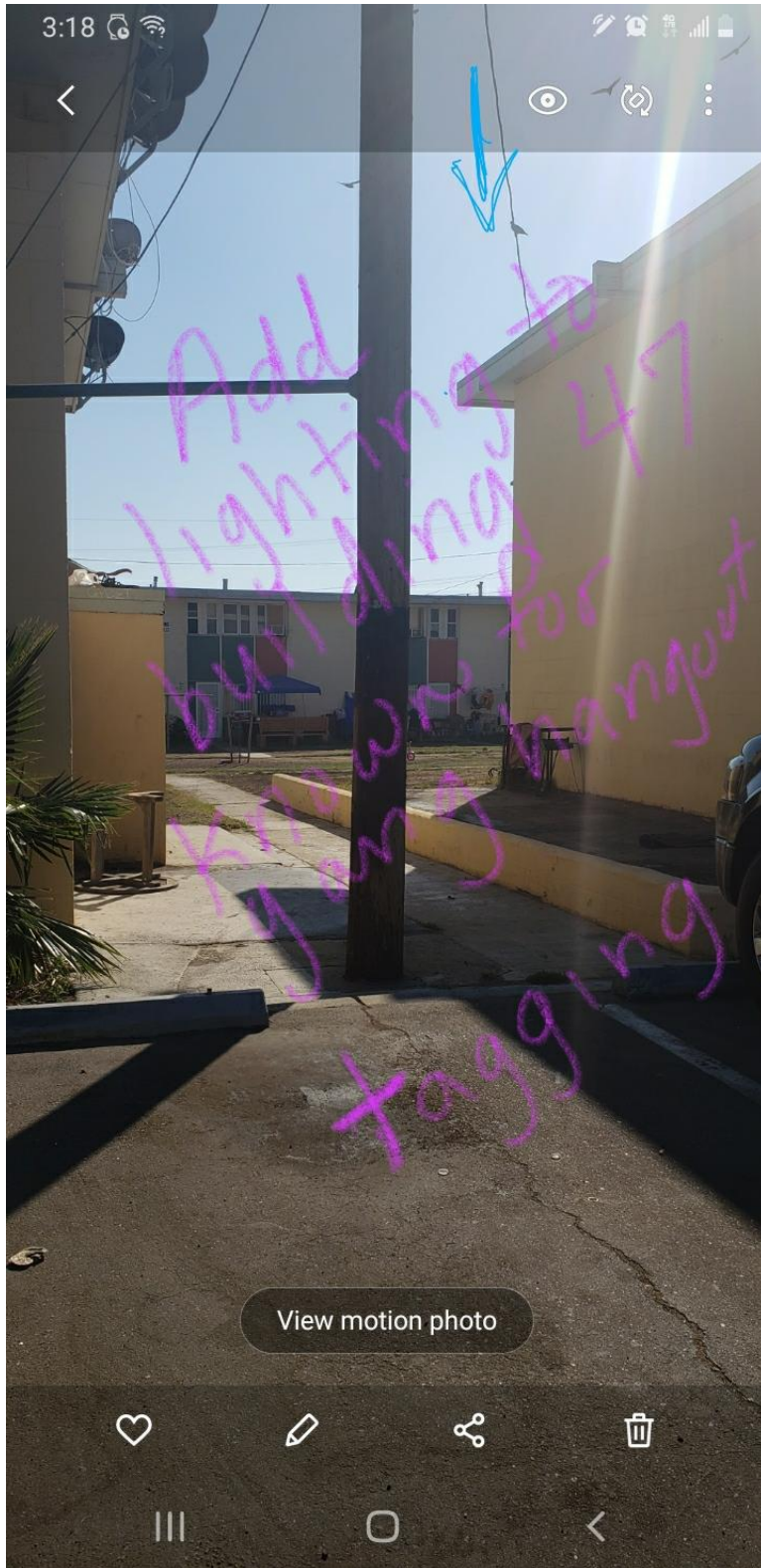
Add lighting between buildings 46 and 47. This is a short pathway, very dark during night hours. Location is known for gang hangout and vandalism.