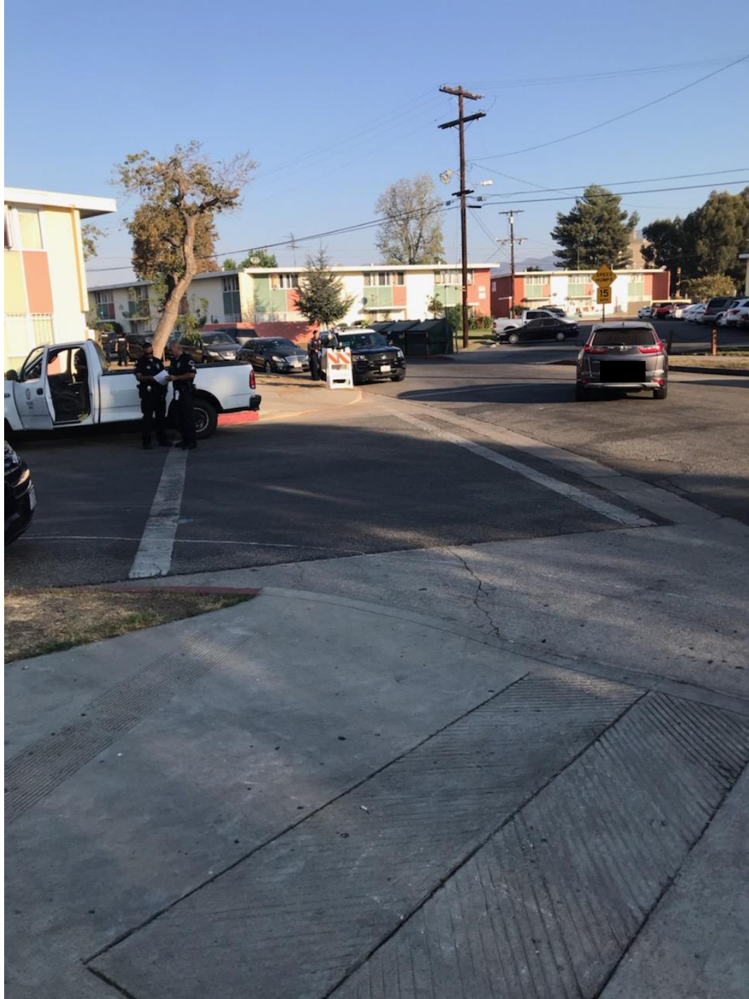
A painted crosswalk at this intersection of Lehigh Ave/Carl St ( view of Carl St. ) The SFG community center is directly in front. Right next to it is a daycare and Guardian Angel pre-school