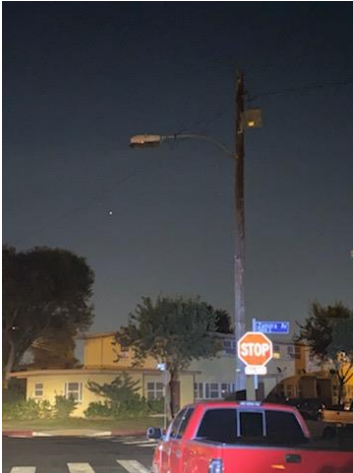
Zamora Ave north of 114 th St (west side of st)