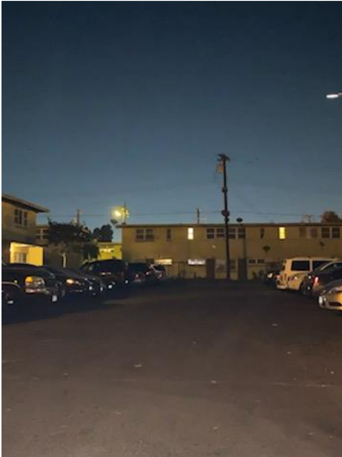
11425 Alvaro St