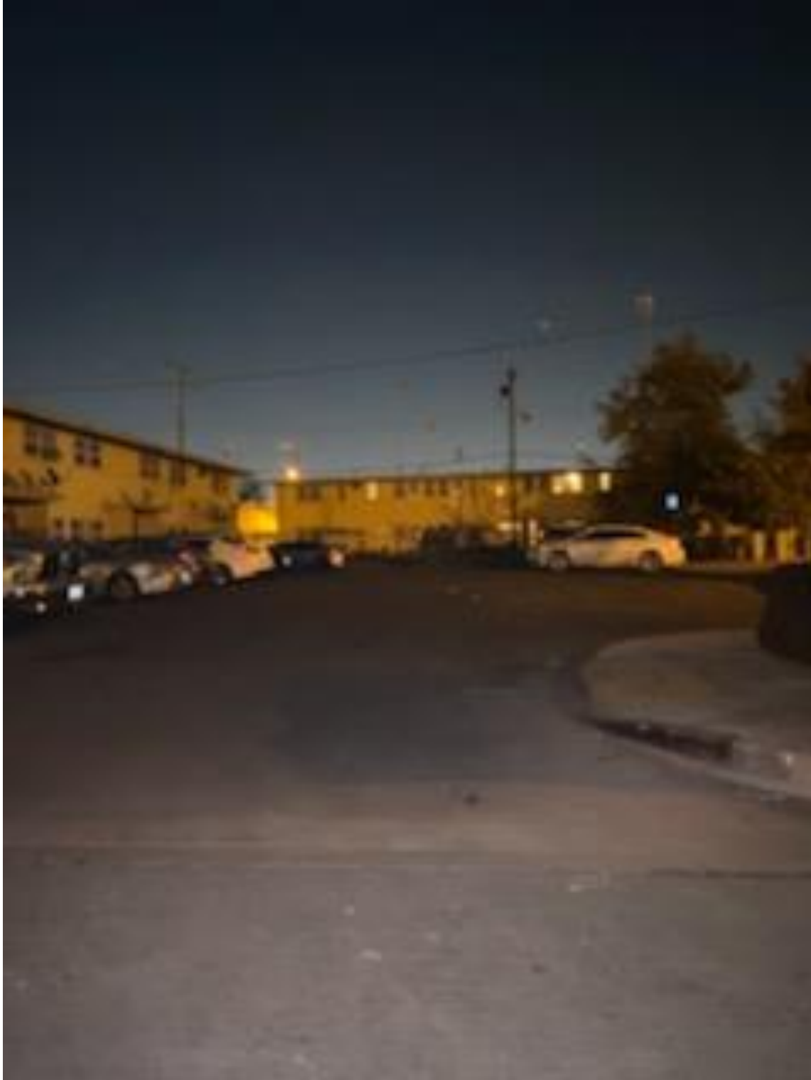
11307 Zamora St, north side of street