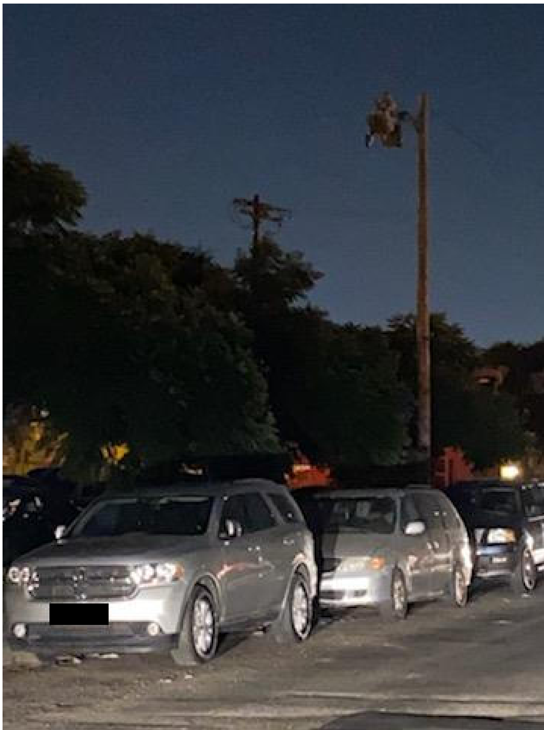
11231 Zamora St