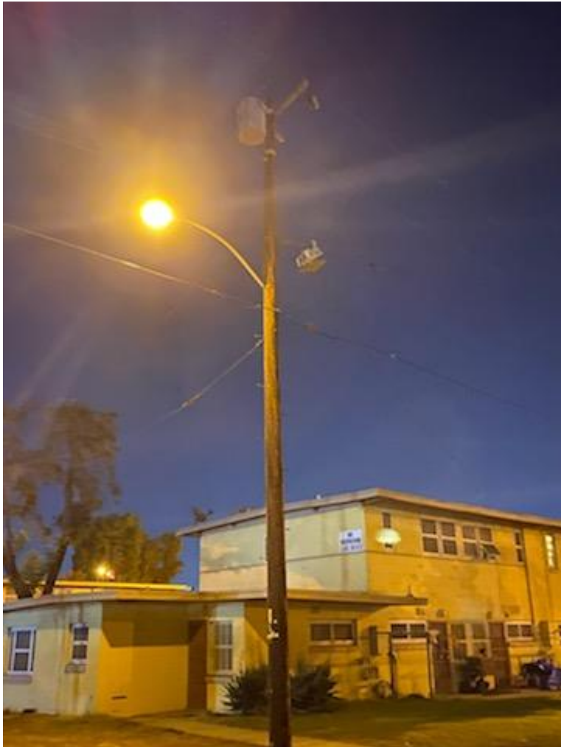
1401 E. 114 th St