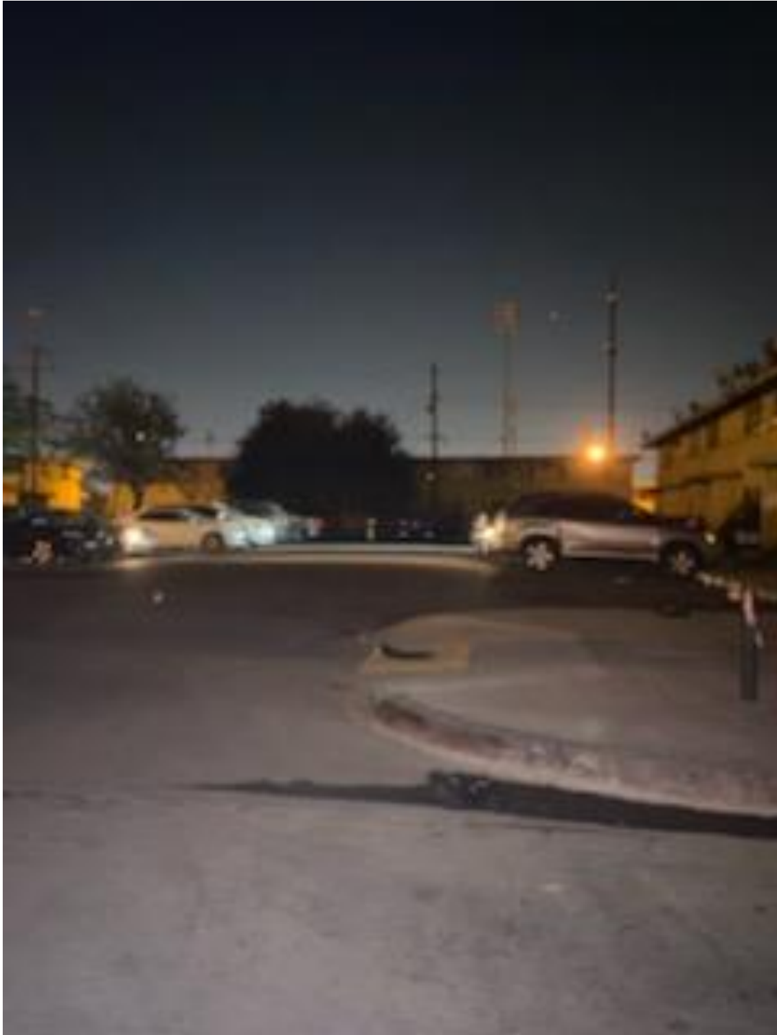
11315 Zamora St