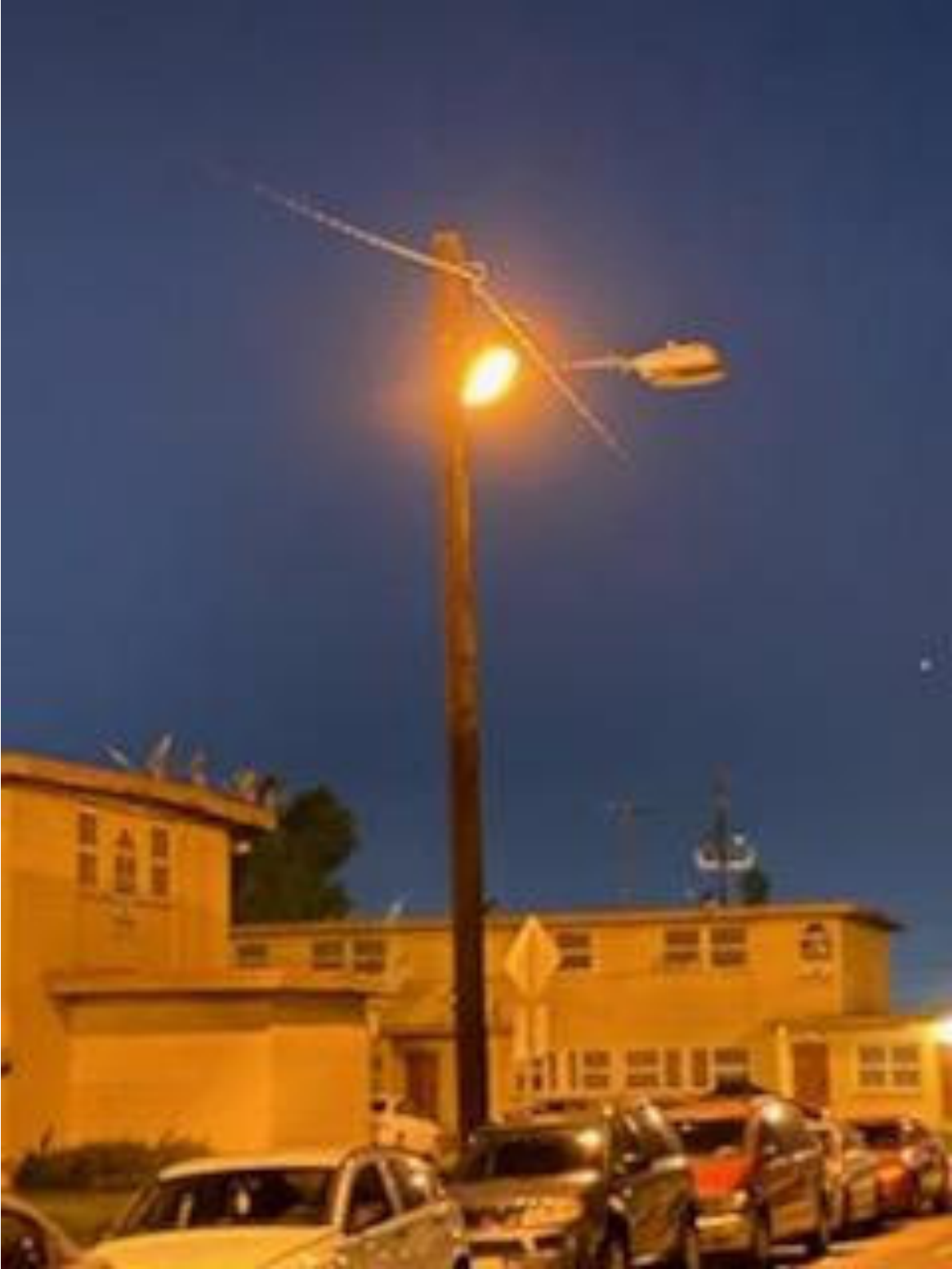
114 th St/ Parmelee Ave