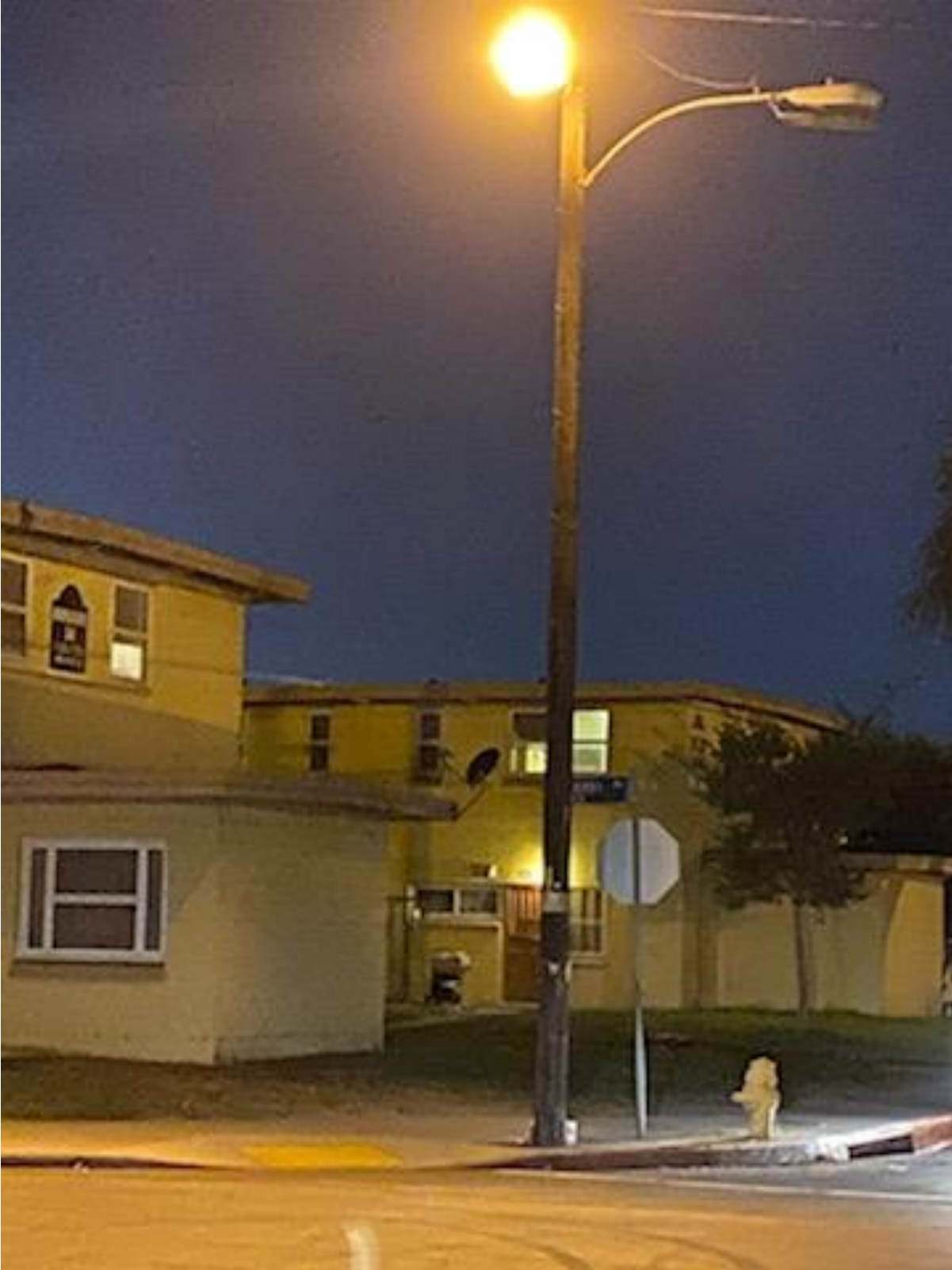
115 th St/Success ST SWC