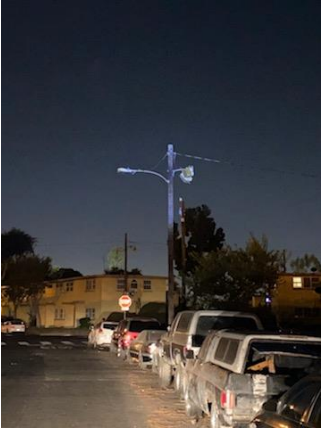
114 th St/ Zamora Ave