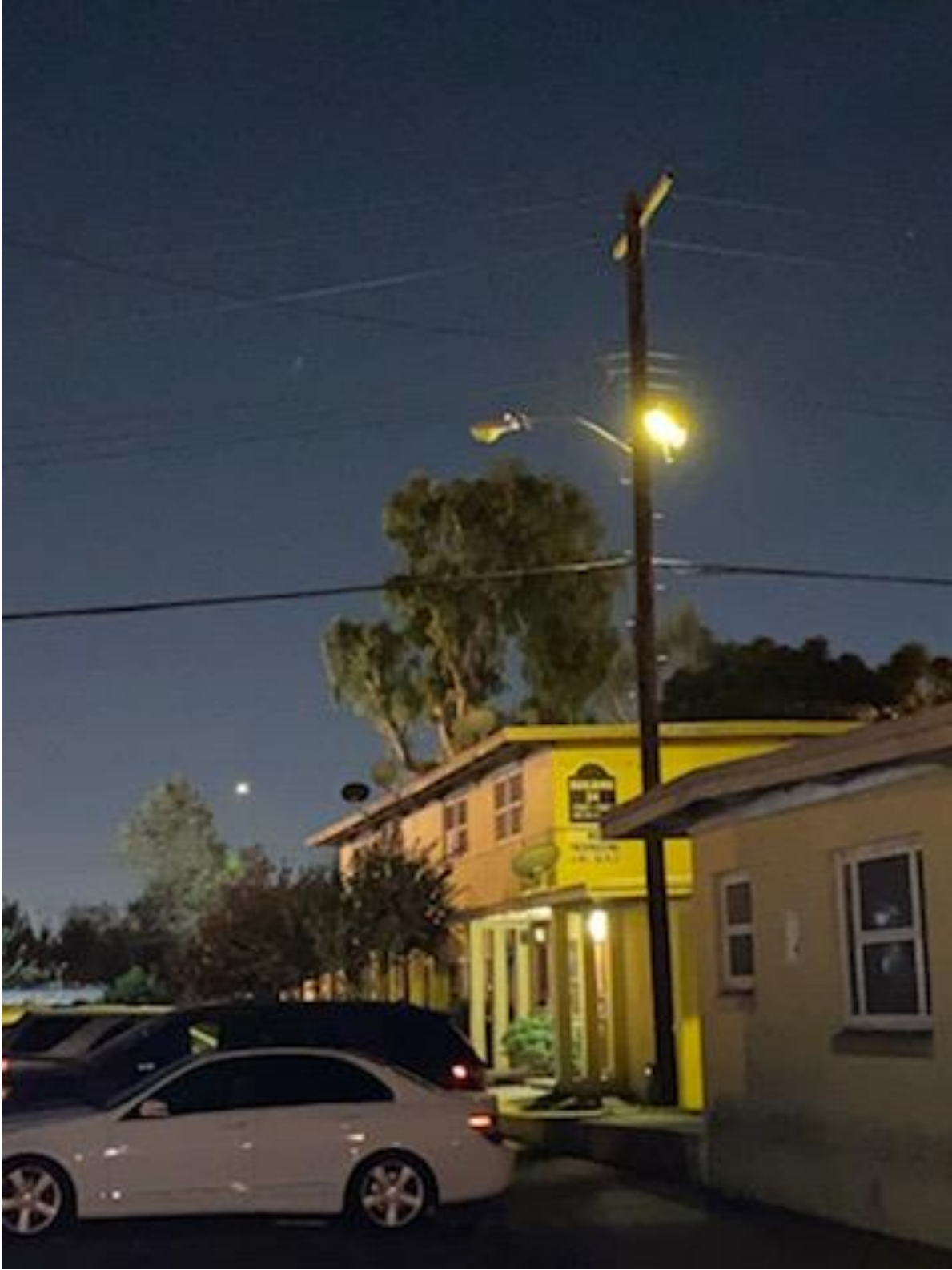
1300 E. 115 th St