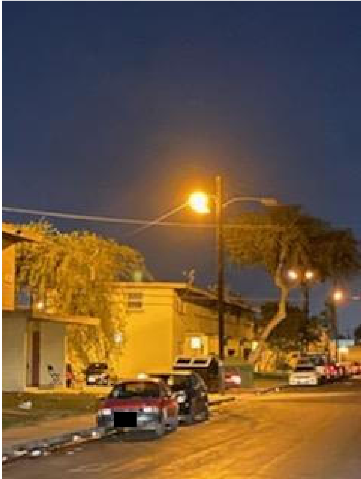
1254 E. 115 th St