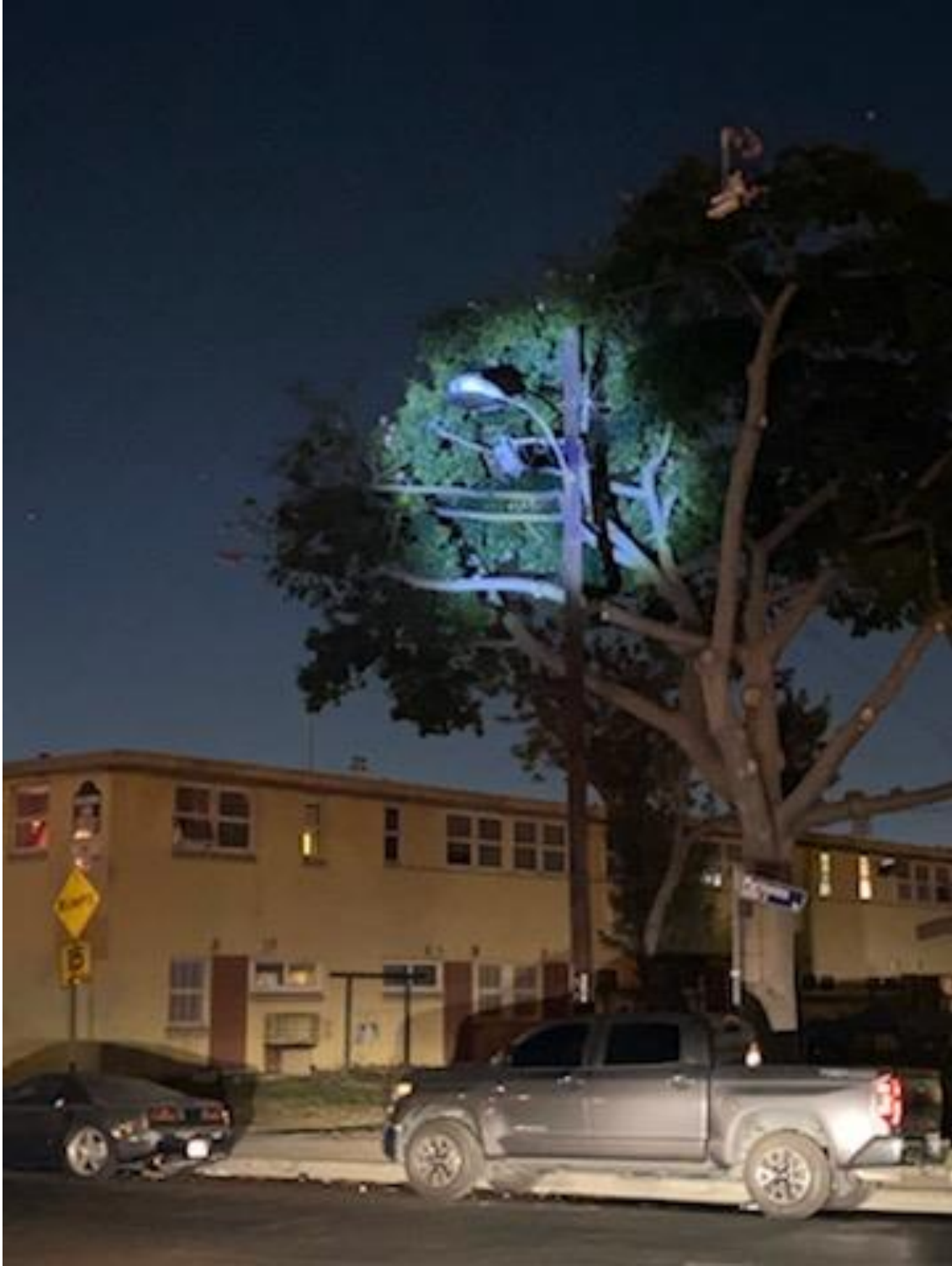
Parmelee /114 th St (North side of street)