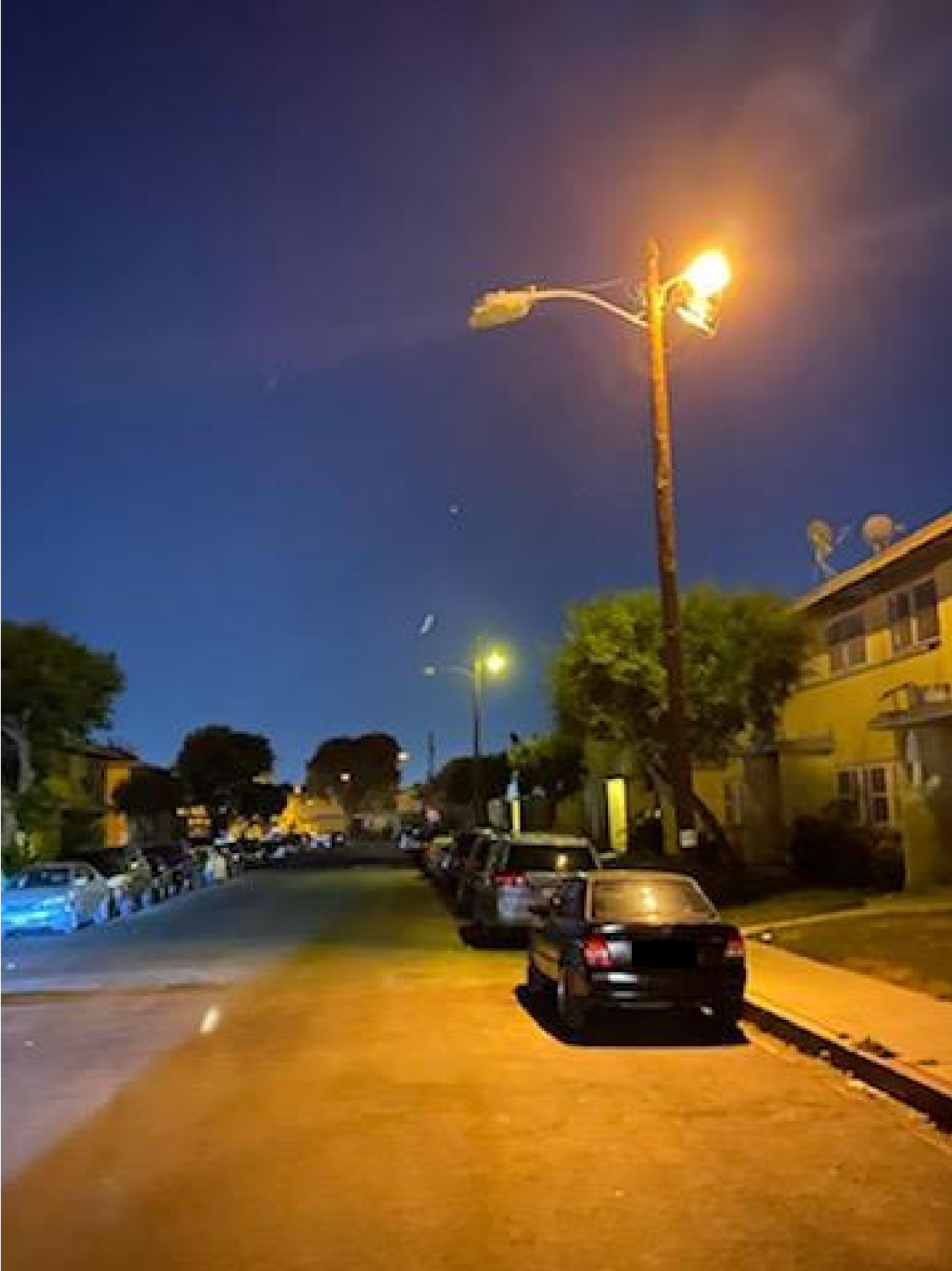
11211 Paremlee Ave NEC parking lot