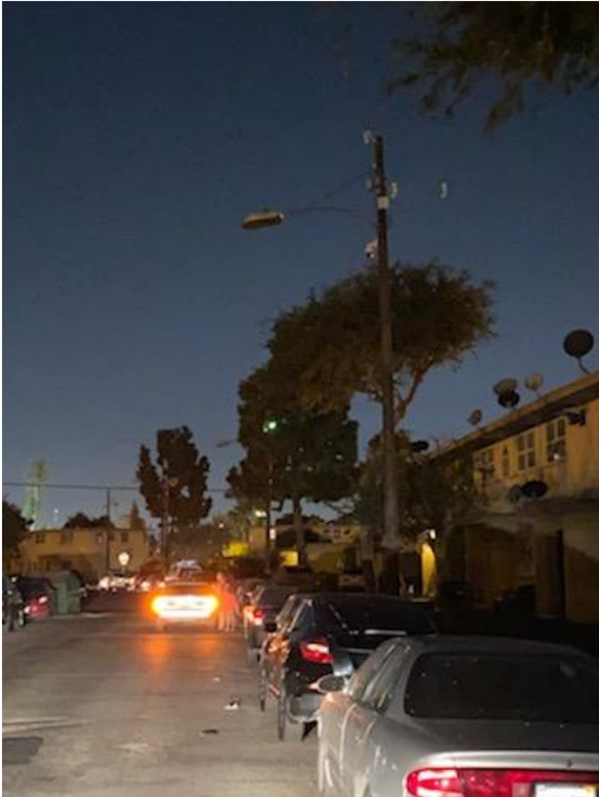
11307 Zamora St, north side of street