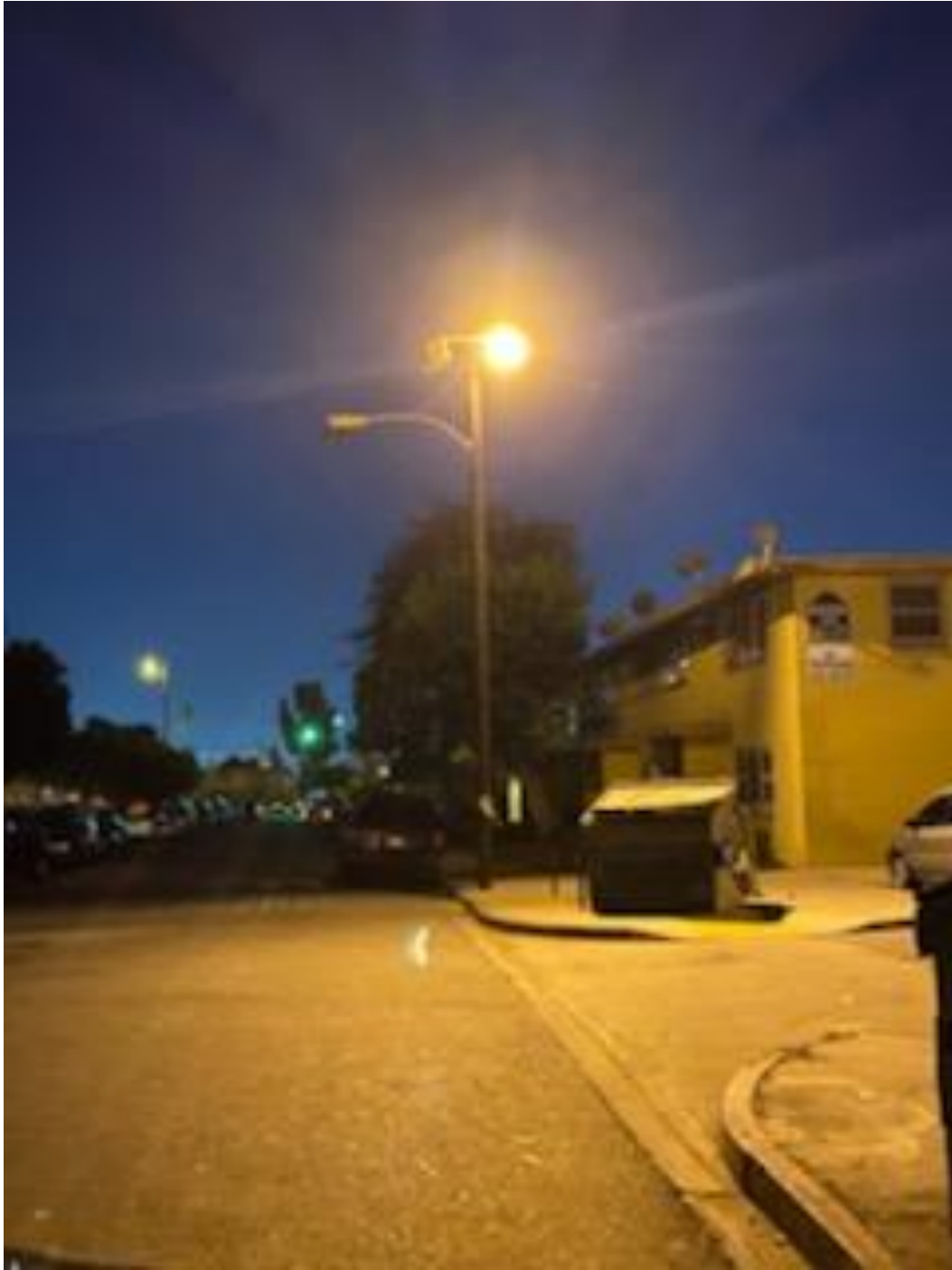
1320 E. 114 th St