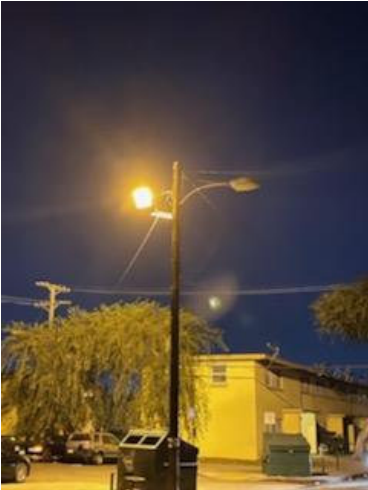
1330 E. 114 th St