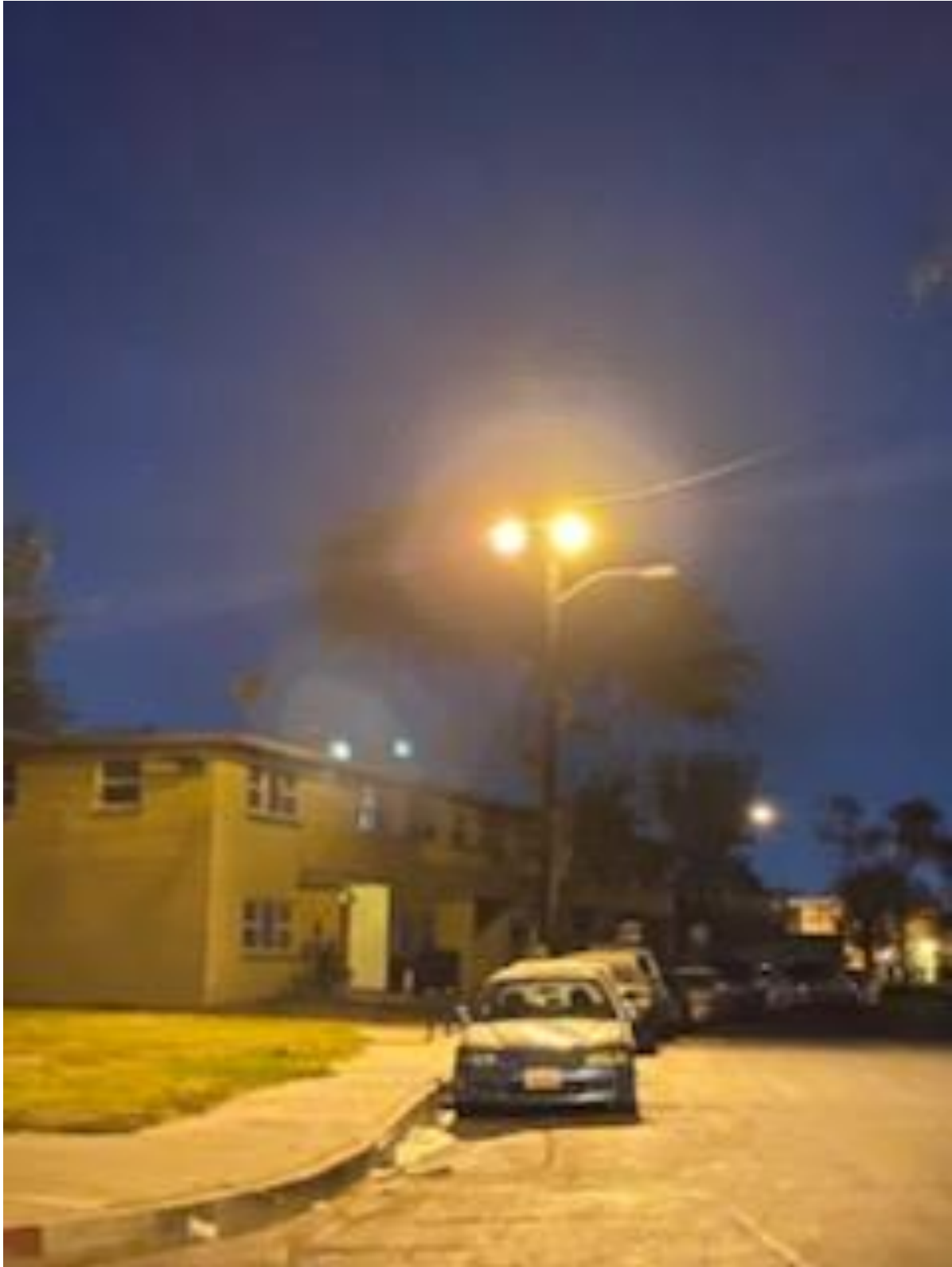
1330 E. 115 th St